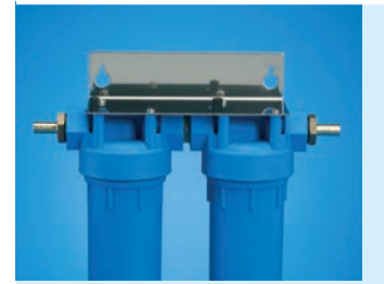
Order No. 2922