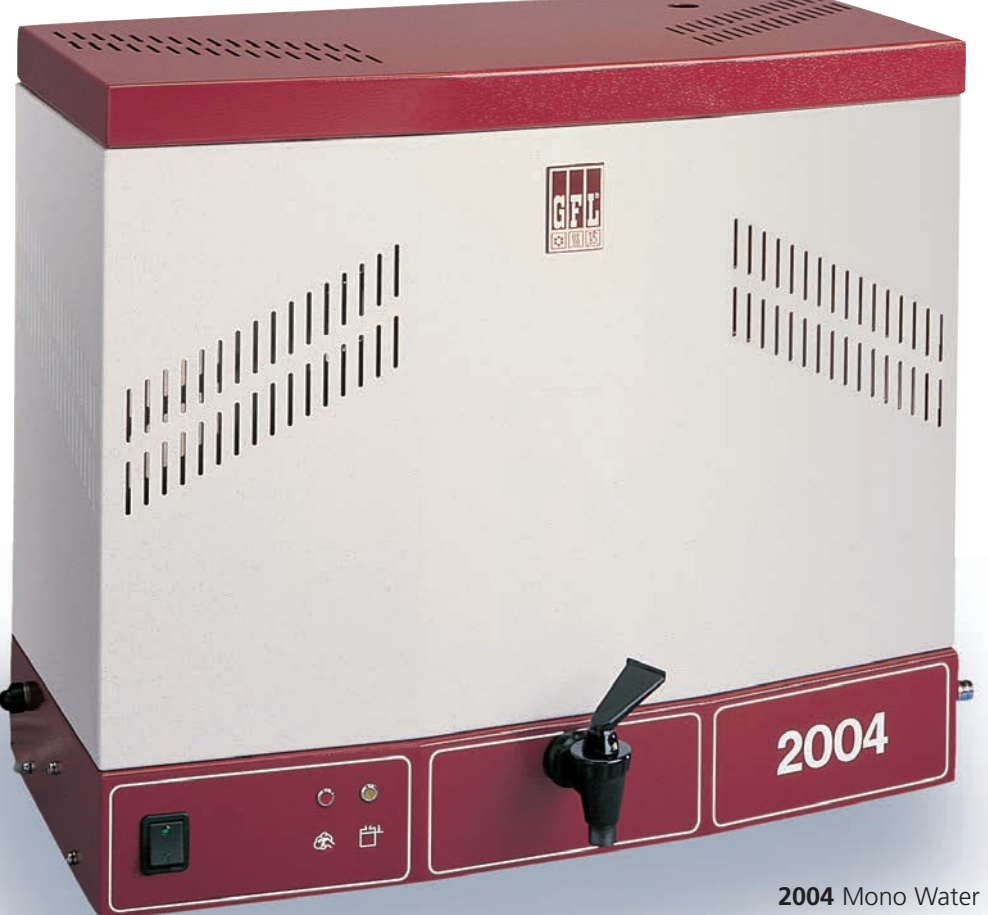
2004 Mono Water Still 4 I / h with built-in storage tank 8 I, for bench and wall mounting