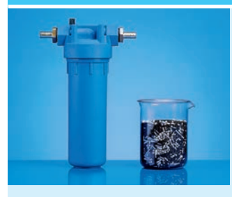
Order No. 2904

Spare Filling for Dechlorite Filter Order No. 2905