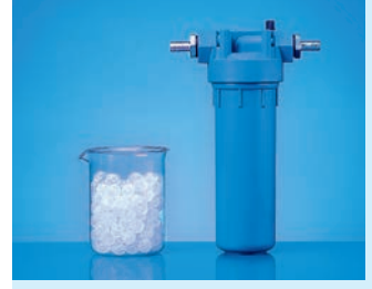
Order No. 2906

Spare Filling for Dechlorite Filter Order No. 2905