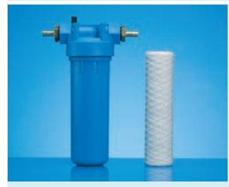
Order No. 2912

Spare Filling for Phosphate Cartridge Order No. 2907