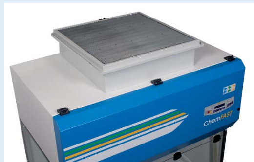
Additional filter housing re-circulating type