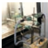
KI DISCUSS TEST